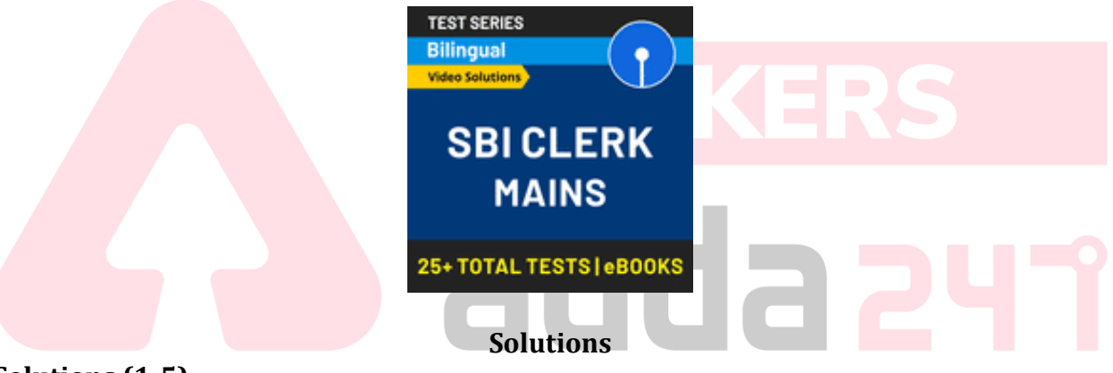
Solutions (1-5): Sol.